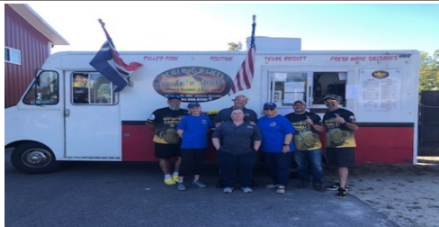
Thank you to the airMALE Cornholers, Hobbs Brewing Co., and Duelling Chefs for the October Fundraising Event for our chapter.