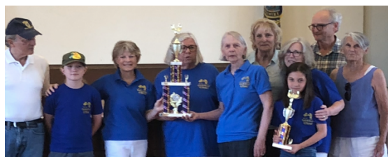
First in Division 2 and Grand Prize in Wolfeboro's Independence Day Parade

Watch for our volunteers selling our annual Labor Day Raffle tickets beginning August 6 th at Hunter's Market, the Farmers' Market, Pier 19, the YumYum Shop, and the Wright Museum. Amazing items!