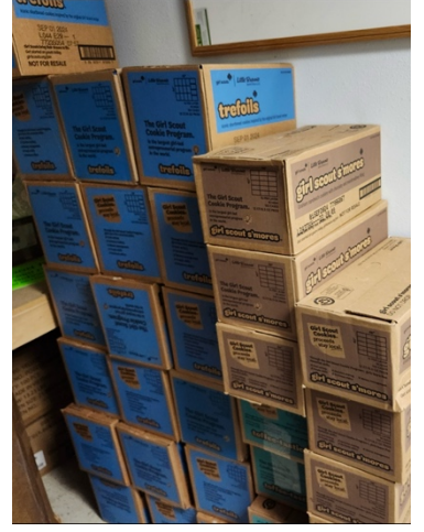
Thank you, Jimmie Kirksey , for your most generous donation of assorted cookies for our kids. We seldom are able to provide such treats. You are putting lots of smiles on children's faces!